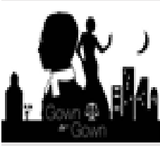
Table Sponsor- $5000